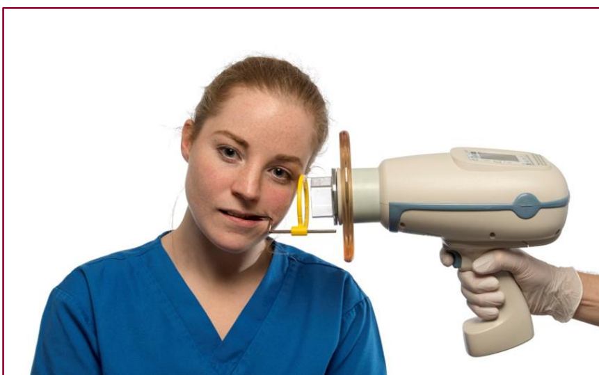
Figure 5: Upper posterior periapical radiograph, showing tilting of the patient's head is required to retain the X-ray beam in the horizontal plane