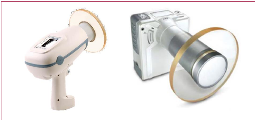
Figure 1: Hand-held dental X-ray units: Aribex Nomad Pro (left) and Dexcowin DX-4000 (right)

The workshop took place in a dental surgery setting, with a volunteer acting as the ‘patient’ being seated in a dental chair. All commonly used intra-oral radiographic views, and oblique lateral views, were trialled. In each case, an image receptor was prepared as normal and positioned in the patient’s mouth as appropriate for each radiographic view. The patient was then positioned so that the spacer cones of the X-ray devices could be positioned properly with regard to the beam aiming device, with the added restrictions that the X-ray beam must remain in the horizontal plane so that the operator remained within the protected zone, and the beam must not be directed towards the abdomen or torso of the patient. The hand-held X-ray devices were used exactly as they would be during normal radiography procedures, with the exception that no actual X-ray exposures took place.